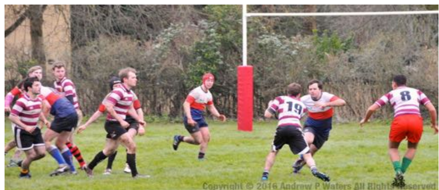
Copyright © 2016 Andrew P Waters All Rights Reserved