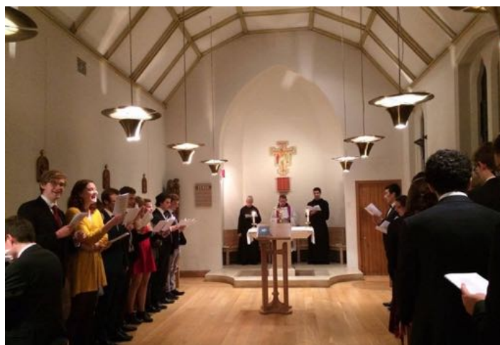
Benet's Carol Service December 2016.

Relations between the Community and students are strong: many of the students will turn to one of the monks when problems arise, whether academic, pastoral or personal. This has proved to be important on a number of occasions this term and is a real strength for the Hall.