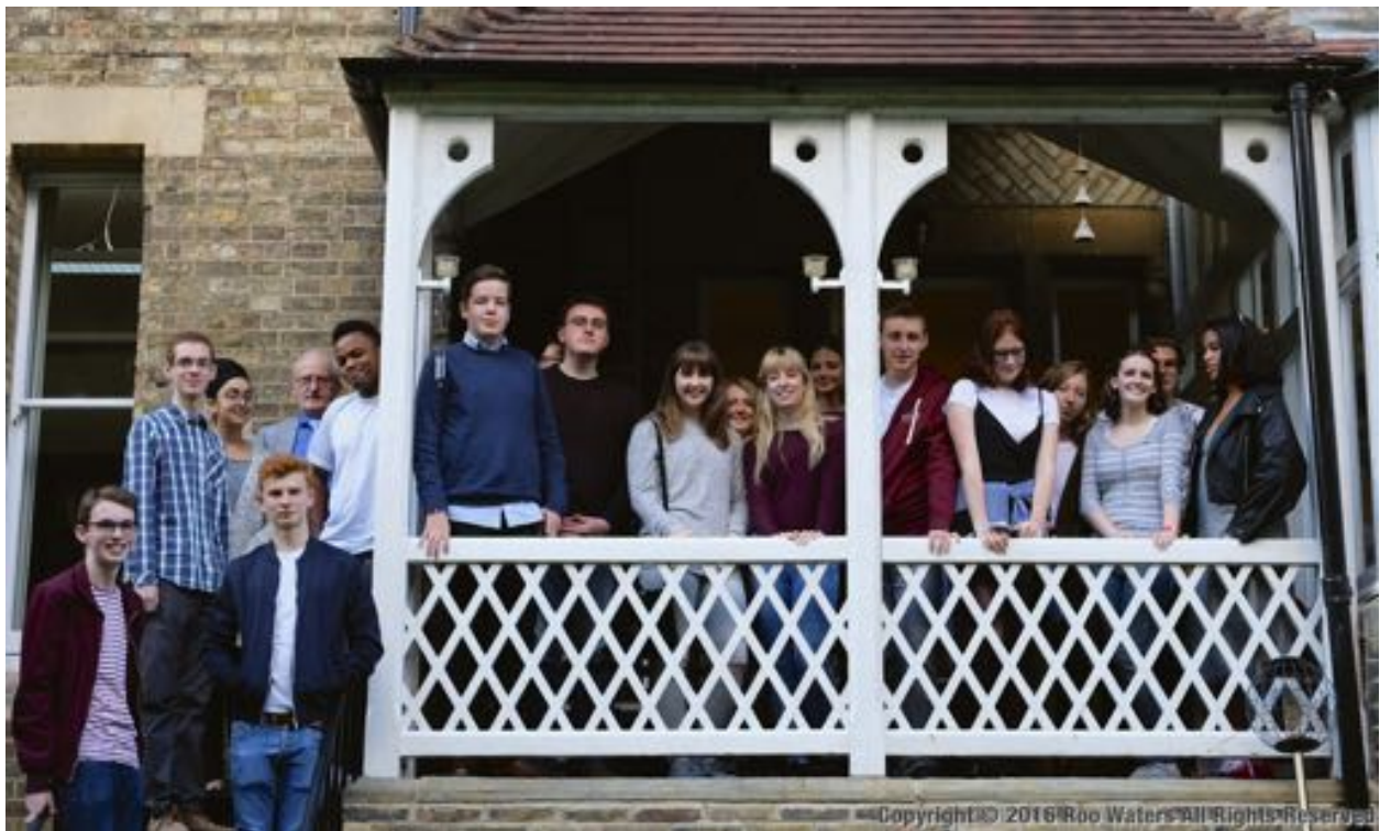
First day at Benet's October 2016 (including our inaugural cohort of female undergraduates)