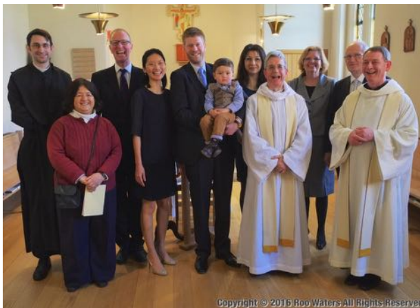
Baptism ceremony March 2016 (including happy family & Hall staff).