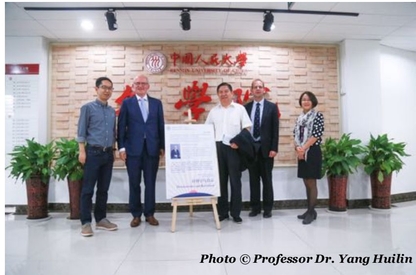
The Mater's lecture at Renmin University of China, Beijing, September 2016

The Master was delighted to have the opportunity to meet so many US alumni and friends of Benet's at the University's Alumni Weekend in Washington DC in April 2016 and at a joint Ampleforth/St Benet's reception in Hong Kong in September 2016..